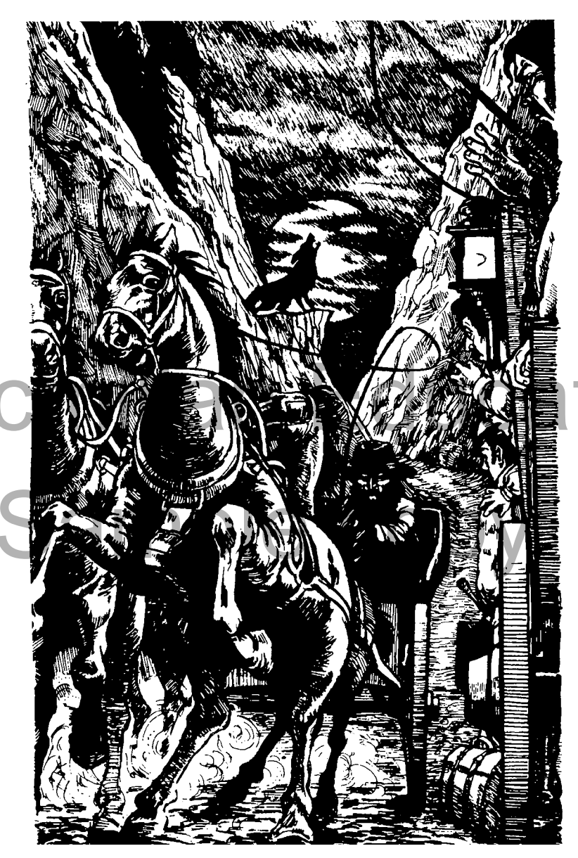
Down the narrow road came a small carriage, pulled by four black horses.